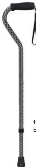
10309DCW-6 Black Wave